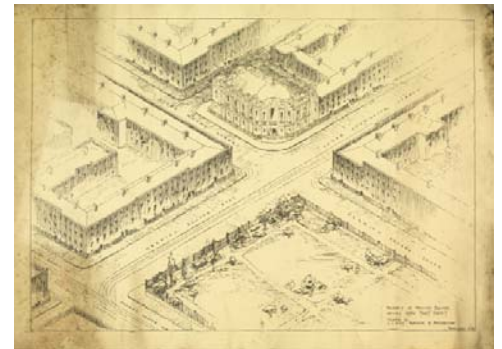
Figures 1, 2 and 3 above: The winning plans and artist's impression of the buildings proposed for the National University of Ireland in 1914.